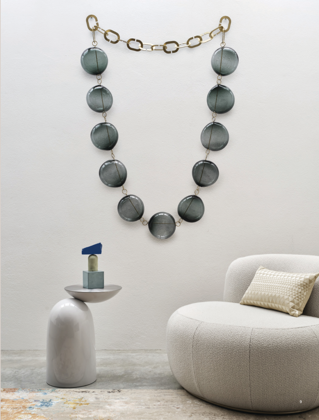
BEAD CHAIN 11 WALLPIECE

Each SkLO Object celebrates the ability of its material to capture kinetic moments in time and transform them into permanent expressions of beauty. Products in the Object collection range from the sculptural to the functional. Each one strives for subtlety, restraint, and beauty.