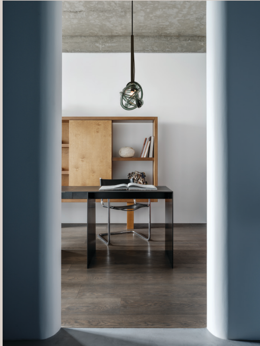
WRAP PIN 1.21 PENDANT Interior Design: Design WOW