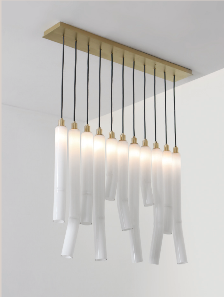
FOLD LINEAR 11 CHANDELIER