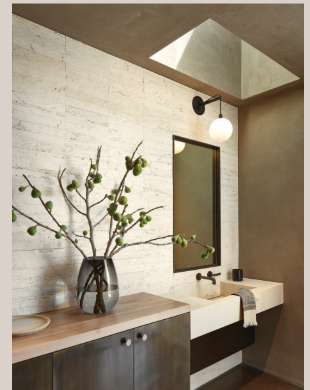
DRAPE ARM 1.09 SCONCE