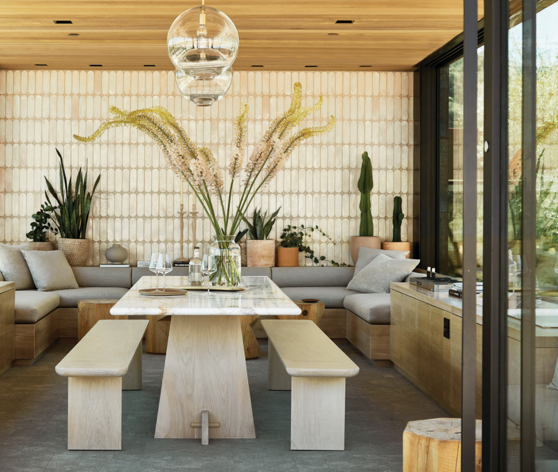
FLOAT 1.0 PENDANT Project: Booker Wines, Paso Robles Interior Design: Katie Martinez Design