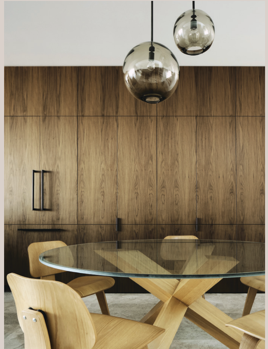
FLOAT 1.0 PENDANT