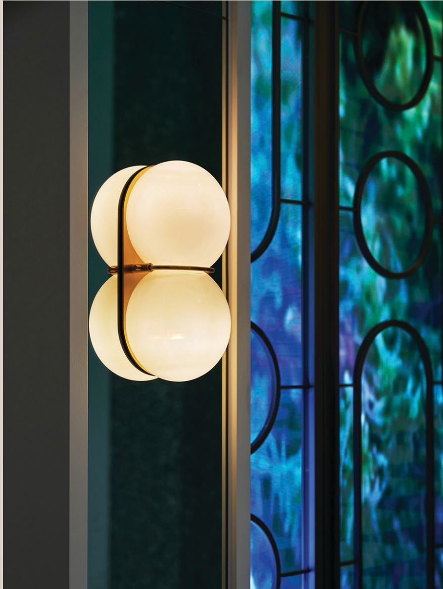
TWIN 1.0 SCONCE Project: Shangree Spa, Seoul Interior Design: Jongkim Design Studio