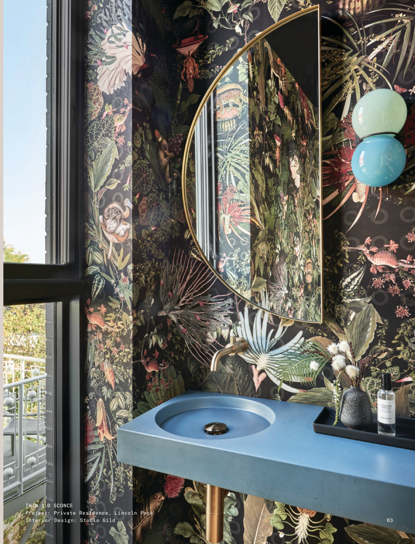
TWIN 1.0 SCONCE Project: Private Residence, Lincoln Park Interior Design: Studio Gild