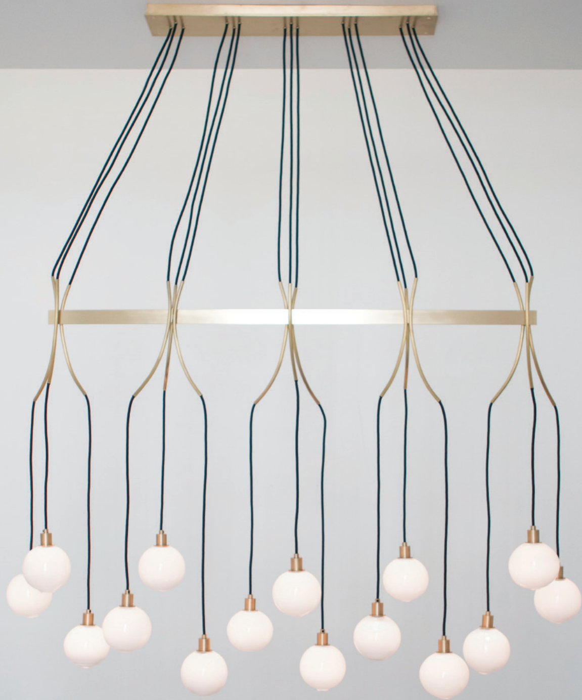
DRAPE SKIRT 15 CHANDELIER