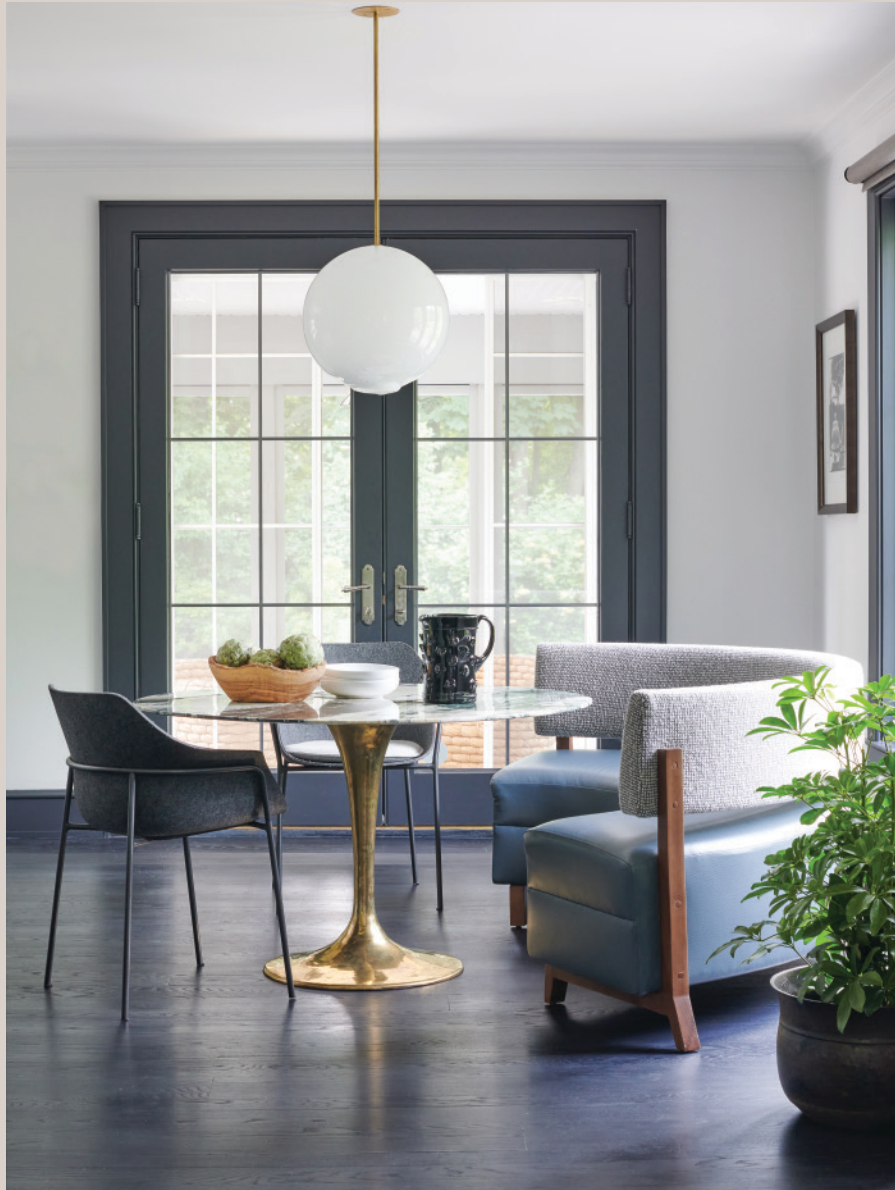
FLOAT 1.0 PENDANT Project: Private Residence, Greenwich Interior Design: Liz Eubank Design