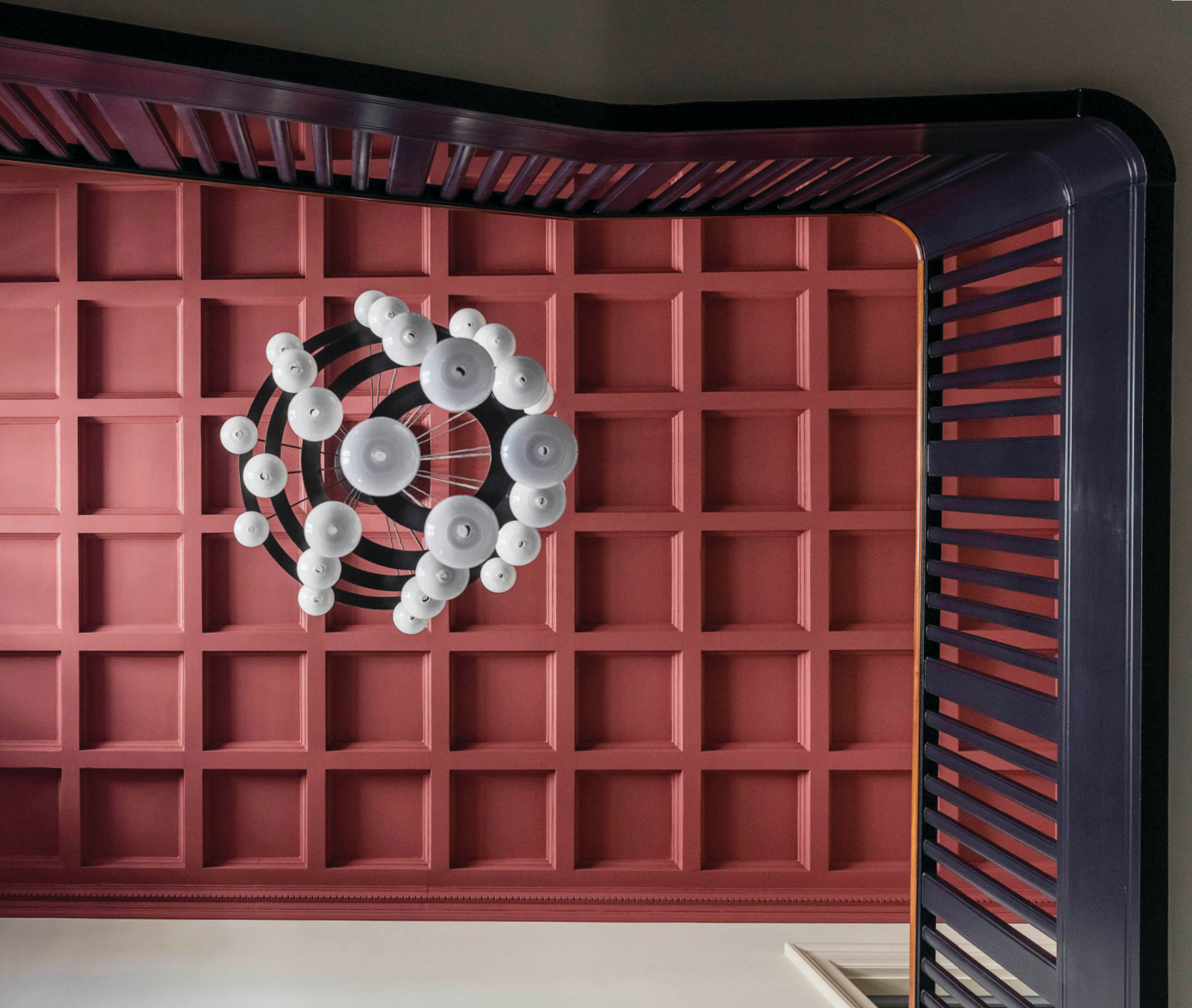
DRAPE CIRCLE 28 CHANDELIER Project: Private Residence, Copenhagen Interior Design: Nadia Olive Schnack