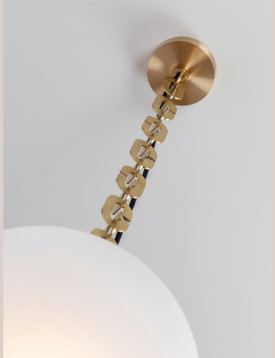
DOME 17 PENDANT