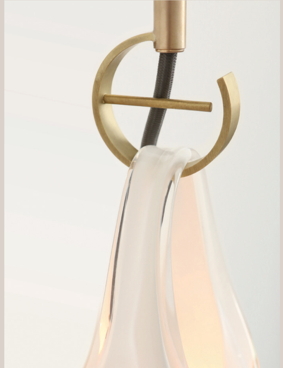
HOLD 12 SCONCE