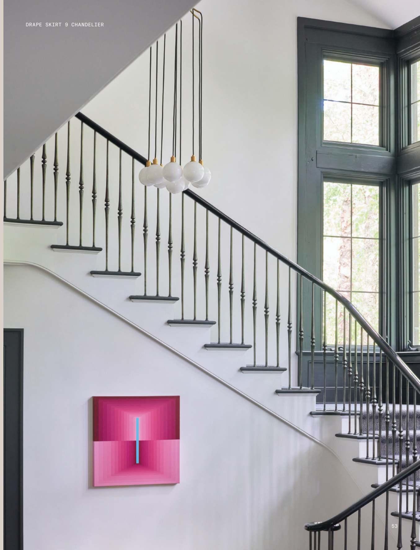
DRAPE SKIRT 9 CHANDELIER