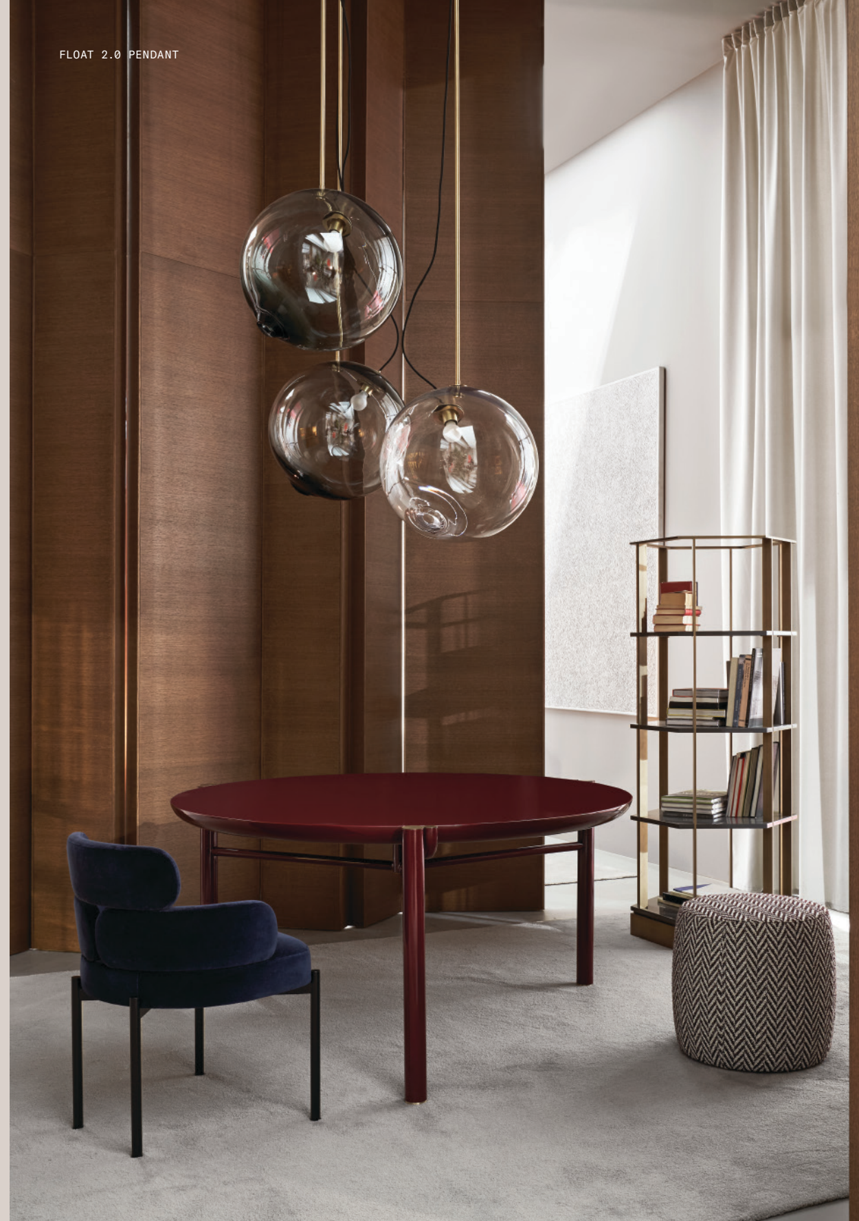
FLOAT 2.0 PENDANT