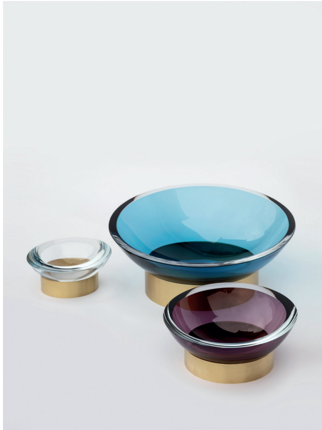
From left: Small/Clear, Large/Steel Blue, Medium/Plum on Brushed Brass rings