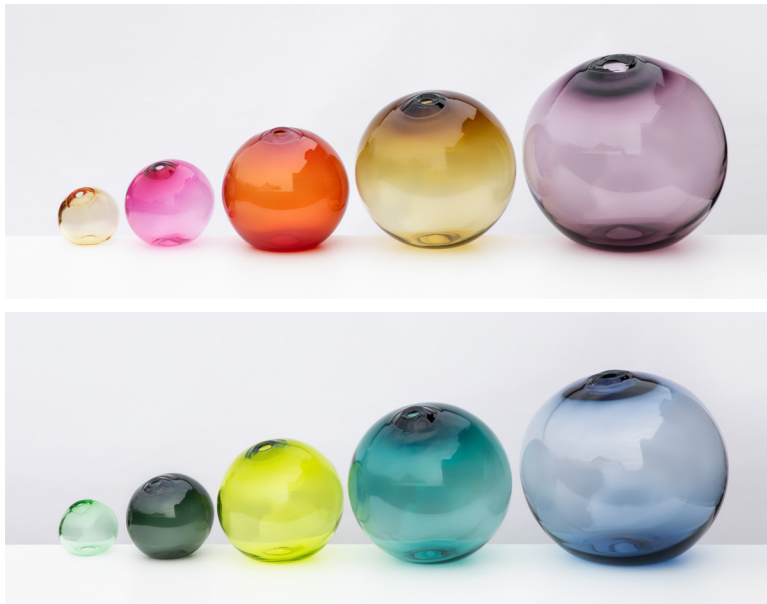
Top, from left: 6" Whiskey, 8" Fuchsia, 12" Strawberry, 16" Sargasso, 20" Plum Bottom, from left: 6" Light Green, 8" Smoke, 12" Lime, 16" Pine Tree Green, 20" Steel Blue